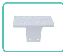
T-SLOT SCANNER AND PRINTER HOLDER 98-465