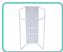
T-SLOT WIPES HOLDER 98-450