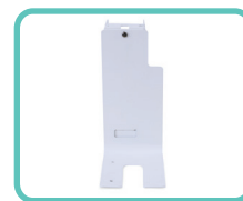
SIDE-MOUNT SCANNER BRACKET, SLIM 2.0 98-466