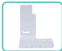
SIDE-MOUNT SCANNER HOLDER, SLIM 2.0 98-467