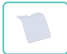
SIDE-MOUNT PRINTER BRACKET, SLIM 2.0 98-468