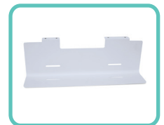
FRONT SHELF, SLIM 2.0 98-476

Download additional resources at ergotron.com .