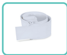
VINYL CORD COVER KIT 98-453